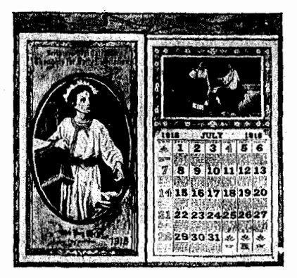
EVANGEL PUBLISHING HOUSE. 3635 Michigan Ave., Chicago.

Sunday Schools, Young Peoples and Missionary Society, and other religious organizations, looking for a way to raise funds, find the Scripture Text Calendar a ready and efficient medium. Agents make good salaries selling the calendar. In spite of rising cost for raw materials the prices remain as in past years: One copy 25c. Five copies $1.00. Twelve copies $2.25. Twenty-five copies $4.25. Fifty copies $8.25. One Hundred $15.00.